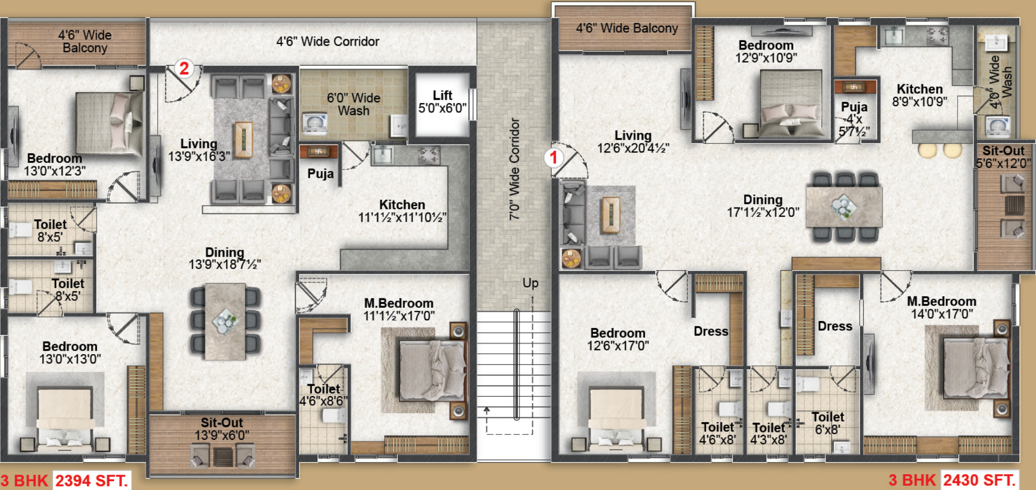
3 BHK 2394 SFT.

Saanvi Sri Nilayam is designed to be a luxurious and lively community of like-minded folks who've always sought a home that has it all, yet is not disturbed by the din and excitement of city life. 3 BHK homes — here's a community with no common walls and lots of space between each apartment, so you reside in a home that's airy and comforting. It has everything that makes for contemporary living and much more!