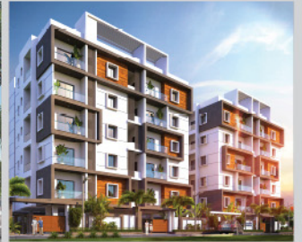
SAANVI AURELIA HOMES