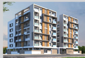
SAANVI SILVER SPRINGS