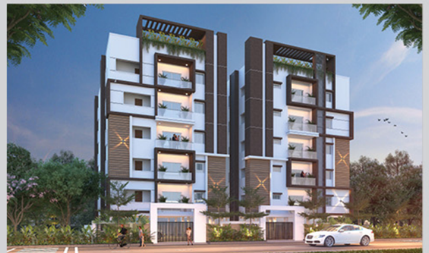
SAANVI ATHENA HOME