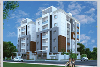
SAANVI AUROVILLE HOMES