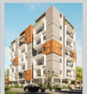
SAANVI ADVIATA HOMES